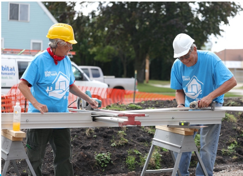
Volunteers cut siding during HFH Oshkosh's veteran volunteer day.